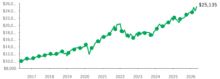
Growth of $10,000 over 10 years for Manulife Dividend Income Fund ±