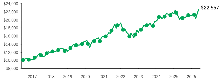
Growth of $10,000 over 10 years for Manulife Global Equity Class ±