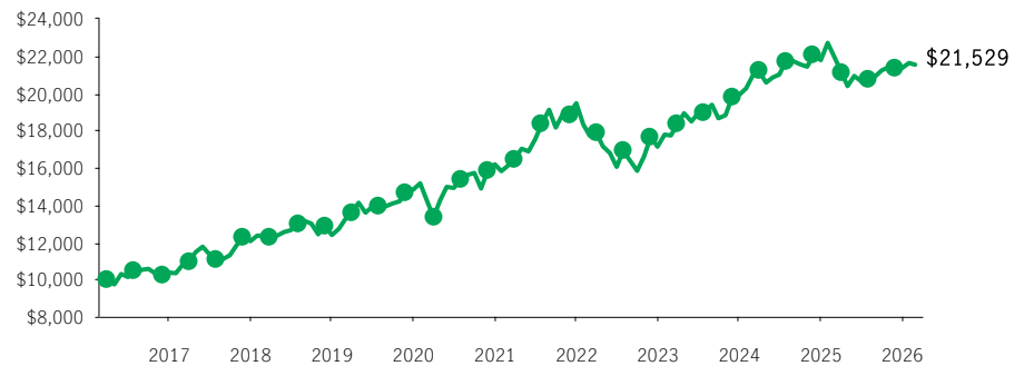
Growth of $10,000 over 10 years for Manulife Global Equity Class ±