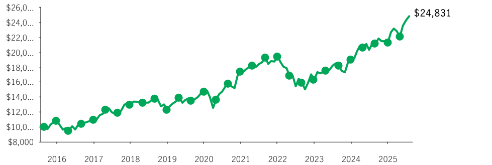
Growth of $10,000 over 10 years for Fidelity Global Fund ±

THIS ACCOUNT IS LINKED TO THE PERFORMANCE OF THE FIDELITY GLOBAL FUND. When you invest in this account, you do not acquire an interest in this designated fund or purchase any units or legal interest in any security.